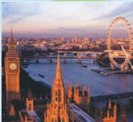
The Thames meanders through the beating heart of London