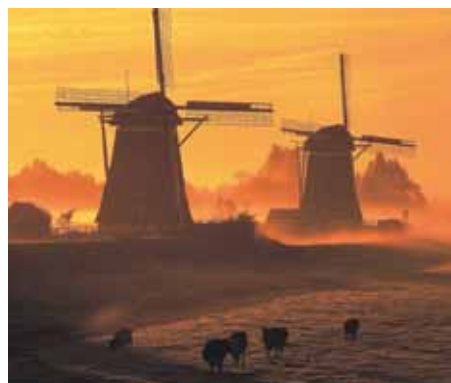
A misty morning in Holland

After breakfast this morning, bid your Tour Director farewell and transfer to the airport to meet your ongoing flight. (BB)