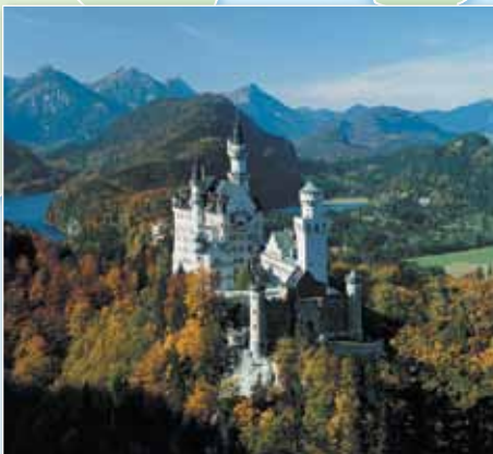
The fairy-tale castle of Neuschwanstein