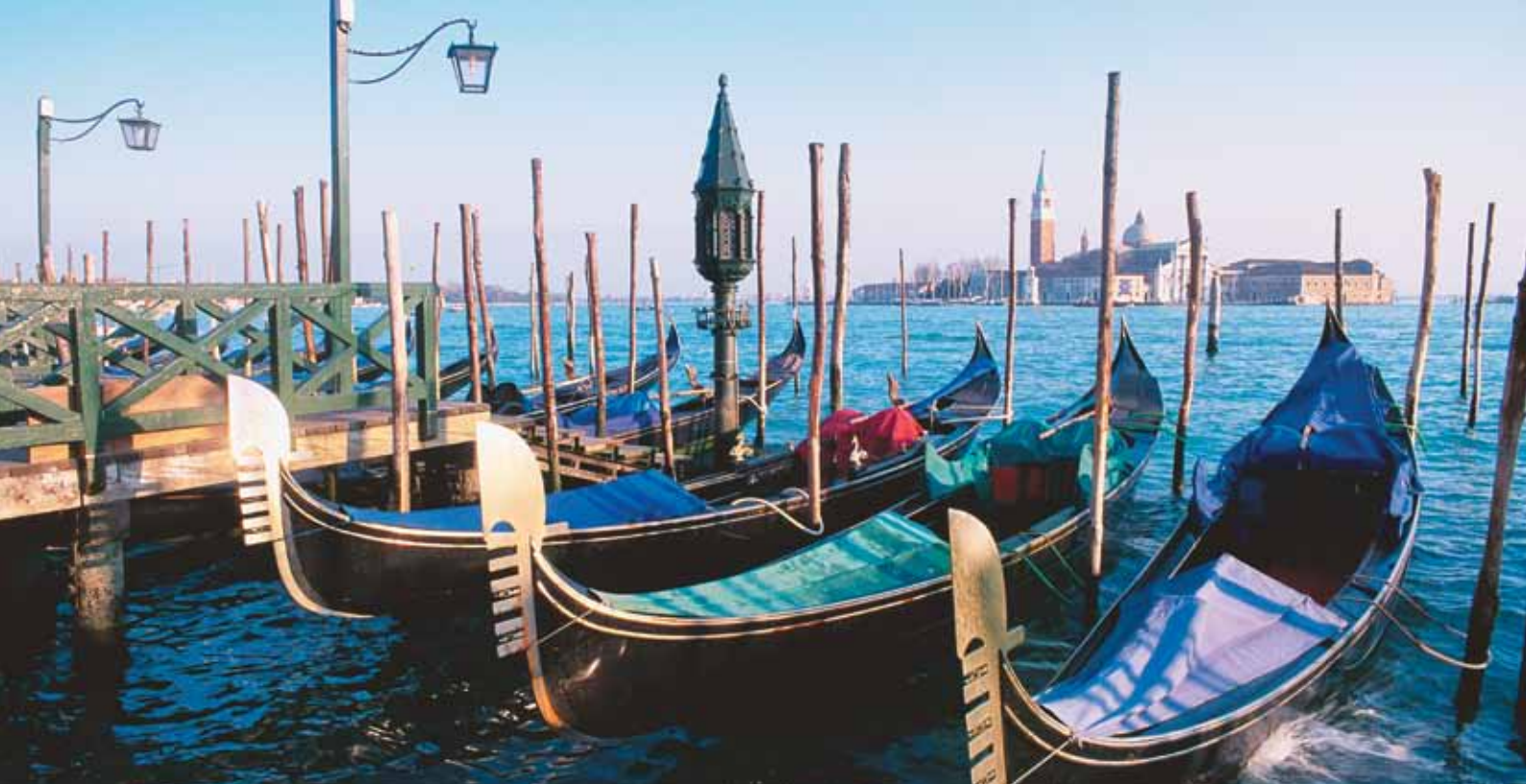
One of the most famous views in Venice - from St Mark's Square over to San Giorgio Maggiore